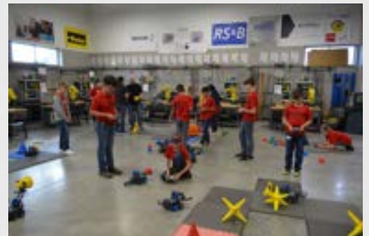
Students at VEX IQ Robotics Summer Camp practice their skills in the arena