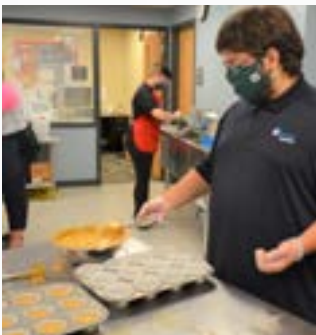
Students learn hospitality skills in the Career Cafe at Wayne County Schools Career Center